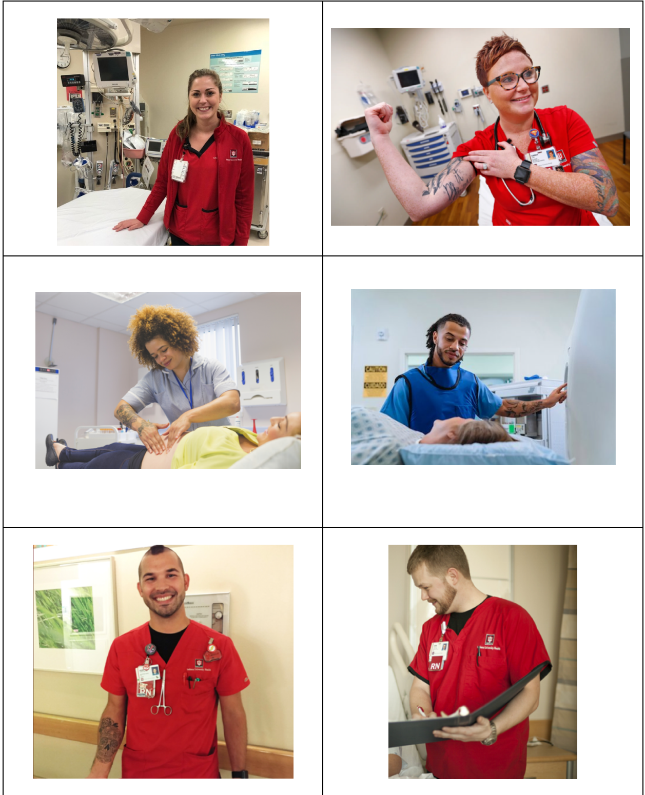
Figure 1: Images of therapists used to rate perceptions of professional appearance of surveyed individuals.